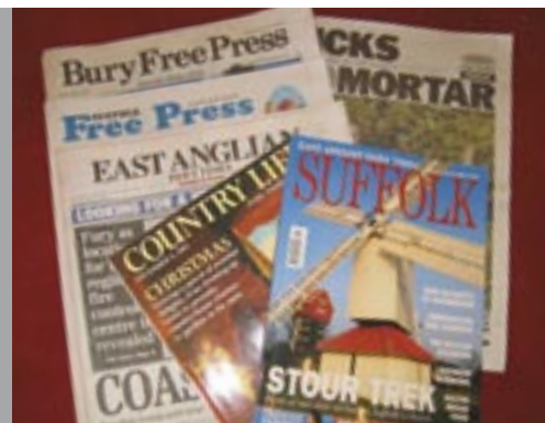
A selection of some of the publications we advertise in