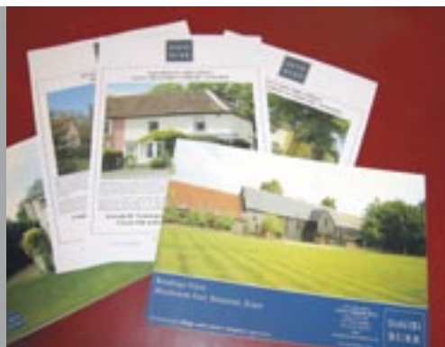
Our sales brochures